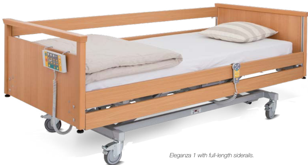
Eleganza 1 with full-length siderails.