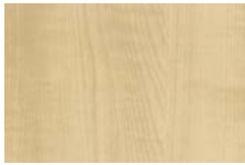
R 5184 Royal Maple

The colour scheme of the bed is highly variable and fully conforms to the environment of the specific facility. By choosing his own design and version the customer will acquire a functional and totally individual model.