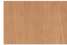
R 4601 Golden red Alder