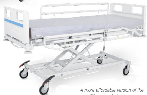
A more affordable version of the non-tilting electric bed.