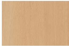
R 5320 White Beech