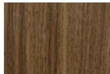
R 4801 Standard Walnut