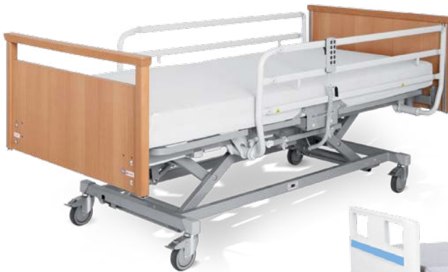
Eleganza 1 LE nursing version.