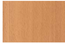
R 5313 Planked Beech