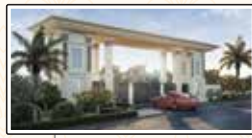
GODREJ GREEN ESTATE