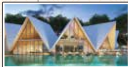
GODREJ COUNTRY ESTATE