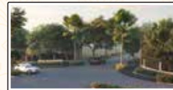
GODREJ ORCHARD ESTATE