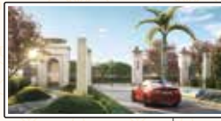
GODREJ PARKLAND ESTATE